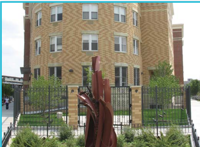
Intervale Green ~ Bronx, NY ~ 128 Units