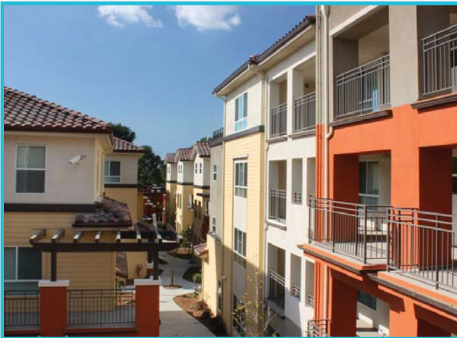
Family Commons at Cabrillo ~ Long Beach, CA ~ 81 Units