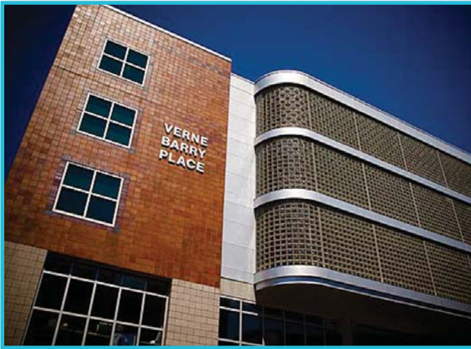
Verne Barry Place ~ Grand Rapids, MI ~ 116 Units