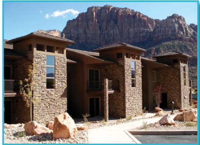
Red Hawk Apartments ~ Springdale, UT ~ 22 Units