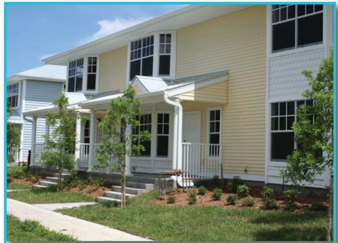
Gulf Breeze Apartments ~ Punta Gorda, FL ~ 171 Units