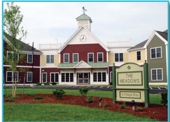
The Meadows ~ North Smithfield, RI ~ 80 Units